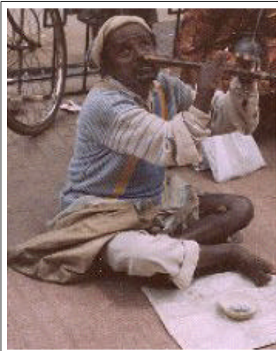
Starving beggar in India. A minute foretaste of famine and disease to plague rebellious mankind!

Indeed you have set out upon the HIGHWAY of LIBERTY! THIS WAY is going to bring to you all THE good things you have EVER desired -- and MORE! God planned it to be so. Thousands of others, like yourself, are now CANDIDATES for the glorious Family of God. They come from all walks of life.