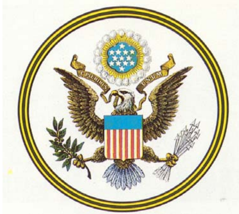
Great Seal of the United States