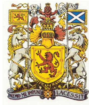
Scotland's Royal Coat of Arms