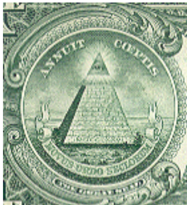
Great Pyramid and All-Seeing Eye