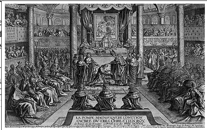
Coronation of Louis XIV of France. Men crown the kings and queens of this world. But Jesus Christ will be crowned King of the earth by the One who possesses all power and authority -- the Creator God, the Father Almighty!

What tremendous event occurs after Jesus is crowned? Will there be a march of triumph climaxing His victory over the nations which opposed His return to establish the Kingdom of God?