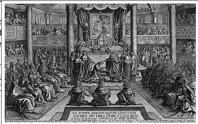
Coronation of Louis XIV of France. Men crown the kings and queens of this world. But Jesus Christ will be crowned King of the earth by the One who possesses all power and authority -- the Creator God, the Father Almighty!

What tremendous event occurs after Jesus is crowned? Will there be a march of triumph climaxing His victory over the nations which opposed His return to establish the Kingdom of God?