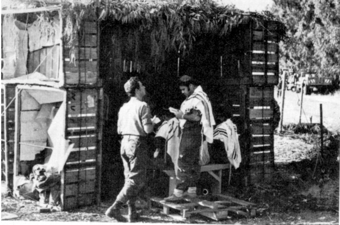
Israeli soldiers build sukkah with old box crates in Golan Heights during Yom Kippur War.

Says Avraham Yaakov Finkel, in The Essence of the Holy Days ,