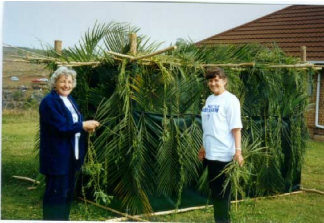
Sukkah built by South African brethren at Feast of Tabernacles 1999.