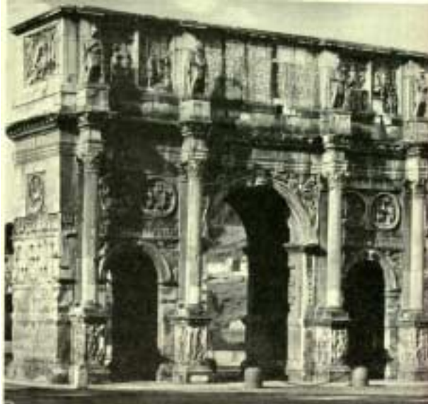
Arch of Emperor Constantine who enforced Sunday observance for Christians throughout the Roman Empire. Sabbath observance came to be forbidden.

Yes, we -- if we are spirit-begotten New Covenant Israelites -- DO have the POWER of the Holy Spirit to save us. And we are receiving instruction in God's Holiness as we REST on His Sabbath Days.